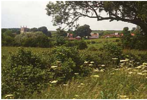
Diverse, wildlife-friendly farmland is under threat from intensive agriculture.

proved a good way of alleviating rural poverty and their creation became official government policy in 1845. By 1873 there were 242,000 of them, one allotment for every three male agricultural workers in England.