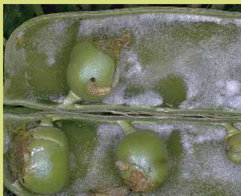
The pea moth caterpillar Cydia nigricana .

Most of the millipedes you see in your garden will be harmless but a few burrowing species are troublesome. The worst villain is the spotted-snake millipede that can damage root crops and potatoes. There's little that can be done about them but as they often exploit damage caused by pests such as slugs, action against these will often limit the damage millipedes can do.