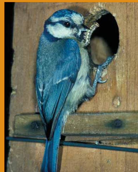
Blue tit chicks have a big appetite.

boxes and provide drinking water. For detailed advice on building and positioning bird boxes get in touch with the British Trust for Ornithology (BTO) or the RSPB (see Contacts, page 37). Most plots should be able to accommodate a small nesting box, but perhaps the wider allotment area provides opportunities for a more ambitious housing project? For example, is there a site that could accommodate a box for owls? A family of these night-hunters on the premises