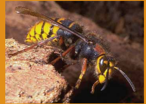
The French wasp Dolichovespula media is now common in many gardens.

aphids in its short life, together with scale insects and young caterpillars. The larvae look like small, flattened, green maggots.