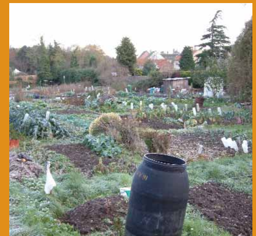
The size of your plot will vary according to local demand.

You will have to pay an annual rent for your plot, the price depending on its size and the level of local demand. On average, expect to pay between £30 and £40 for a 250 square metre plot, though this price can more than double in areas where land is scarce. Some allotment authorities vary their charges according to the availability of water and other amenities, and most have concessionary rates for pensioners and the unemployed. More details can be found in Allotments: a plot holder's guide available from www.communities.gov.uk