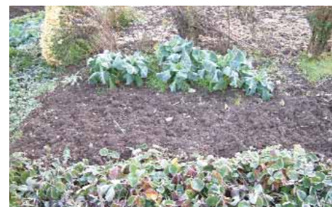
Winter digging exposes pest larvae to predators and the cold.

The latter is important as a number of notorious pests survive the winter as ground-dwelling grubs, including