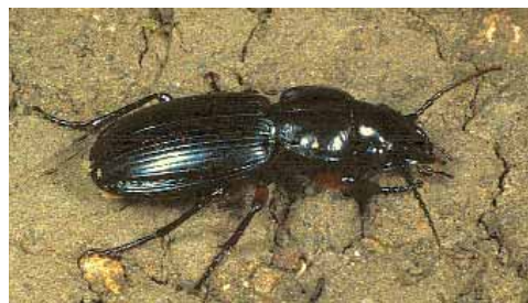
A ground beetle Pterostichus madidus .

One way of controlling pests without resorting to chemicals is to try companion planting – a system where different plant species are grown