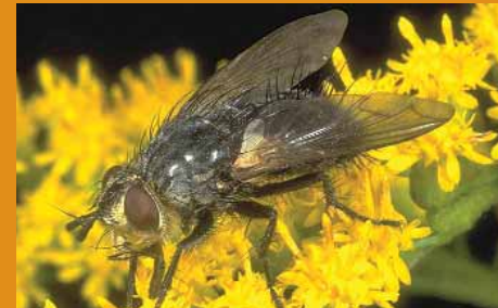
A tachinid fly. Their larvae are parasitic on many pest species.

The adults are not carnivorous but most hoverfly larvae are ravenous hunters: each consumes around 900