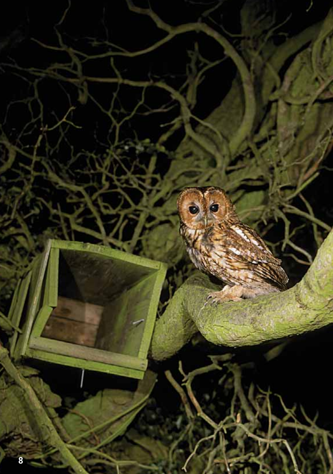
A tawny owl Strix aluco . It's not just blue tits that benefit from nesting boxes.