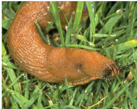
Arion rufus , the red slug.