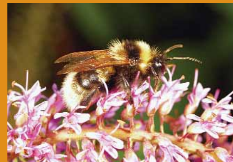
The small garden bumblebee Bombus hortorum .

These will create a multitude of habitats for beneficial animals. Even a small stone pile on your plot will be a home to useful beetles and centipedes. Larger piles may shelter slug-eating frogs, toads and slow-worms or, very occasionally, a family of stoats or weasels to help keep down any local rodents and rabbits. Hedgehogs can also benefit from these structures (though logs will have to be at least 10 cm apart) but if you wish to encourage them to feed on your slugs it might be