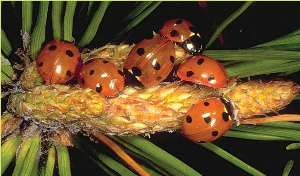
A valuable ally, the seven-spot ladybird Coccinella septempunctata .