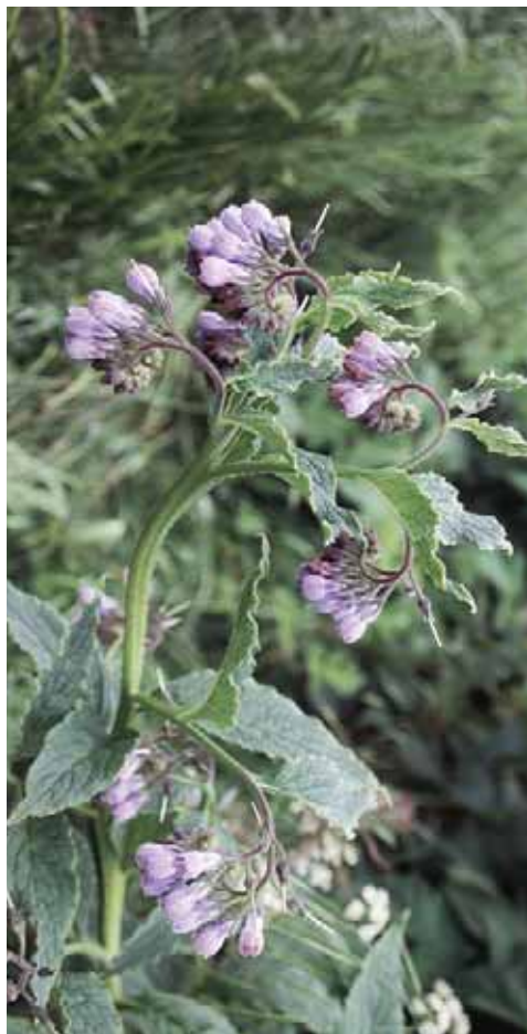
Comfrey makes an excellent liquid manure.

potassium. Some gardeners maintain a patch of comfrey and use its leaves to make a liquid manure. To make your own, steep 1 kg of leaves in 15 litres of water, let the mixture stew under cover