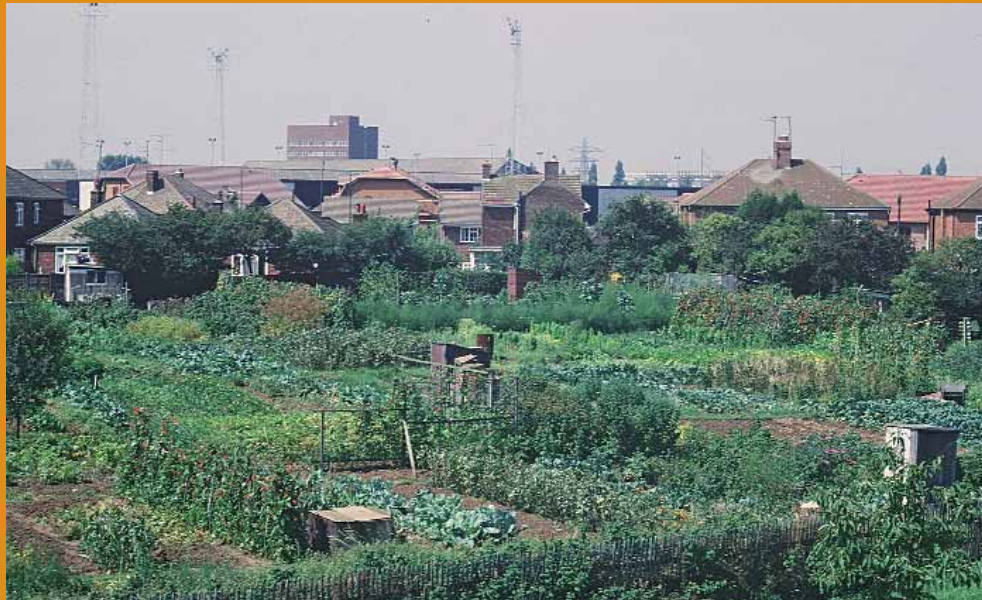
Allotments are a refuge for both people and wildlife.

Allotments have been around for a long time. They were originally created for poor agricultural workers to compensate them for the loss of common land during the enclosures of the eighteenth century. Allotments