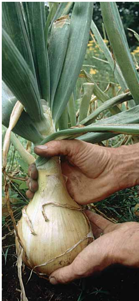
Know your onions! Organic wildlife-friendly gardening can produce great results.

heritage varieties to their catalogues. Why not introduce a few heritage vegetables to your plot? Apart from the fun of trying something different, the interplanting of heritage and hybrid varieties of the same crop could have advantages (see Companion planting, page 22).