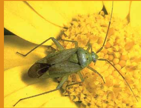
The potato capsid Calocoris norvegicus .

closely related green-veined white is not a pest species). Squash their oval, yellow eggs when you find them and exclude the adults with a fine mesh netting.