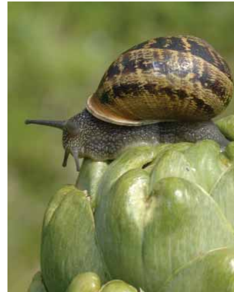
Snails like artichokes too.

relies on the barrier being dry and, even when it is, many slugs can burrow underneath. Laying copper strips or old copper pipes around raised beds can help as these generate a weak electric current that slugs find unpleasant.