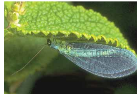
Look after beneficial insects such as the green lacewing Chrysopa carnea .

The key to getting wildlife to work with you is to look after the beneficial creatures that already live on your allotment and to encourage more – and different ones – to settle there. Perhaps the easiest way of conserving wildlife is to reduce your use of toxic chemicals, ideally cutting them out all together (see also Companion planting, page 22). Most toxins found in pesticides are non-specific and are just as likely to kill friends as foes. Spraying against pests will often kill their predators as well, meaning that the next wave of pests that blows in