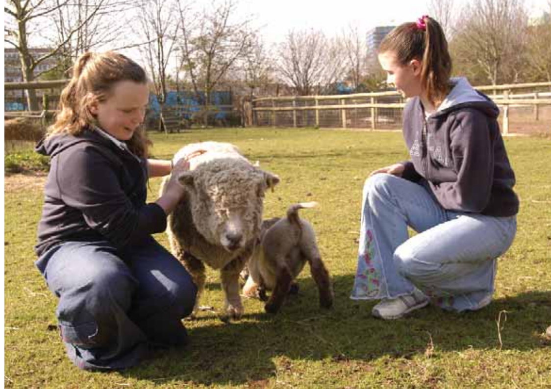
City farms can provide a unique learning experience in urban areas. Federation of City Farms

Many of these green spaces have been created by community groups on derelict land and, unlike traditional allotments, these sites have little legal protection. However, despite their often unconventional origins these projects usually have the strong support of their local council. If you're involved with a community green space or know of an area that could be developed as one, contact the Federation for their advice (see Contacts, page 37). The Federation is also supporting the work of the Allotments Regeneration Initiative (see History, page 2).