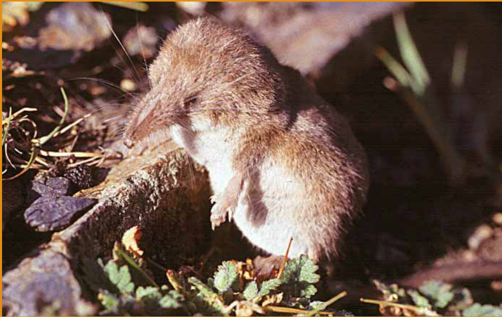
A pygmy shrew Sorex minutus on the look out for its next meal.