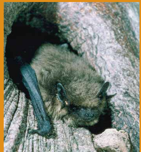
A single pipistrelle bat can catch over 3,000 flying insects in a night.