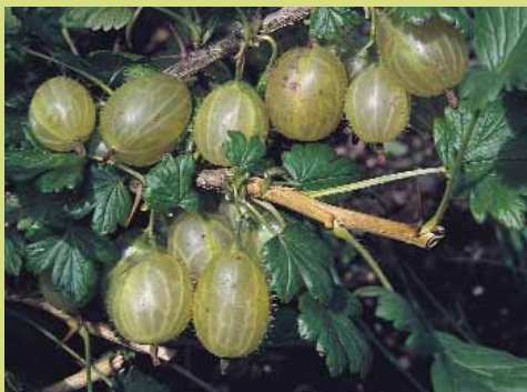
Expose pests by growing gooseberry plants as a cordon or fan. Mr Fothergill's