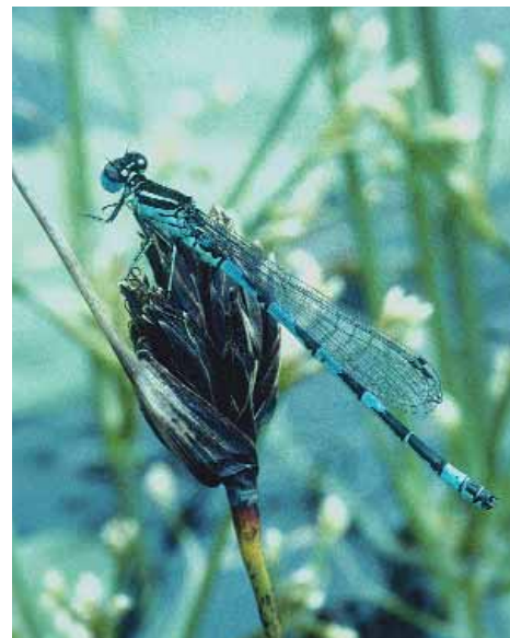
A pond will attract many kinds of predator, such as this southern damselfly Coenagrion mercuriale .

Before creating a pond you must obtain the permission of your allotment authority. Ponds can be a hazard, especially where young children are concerned.