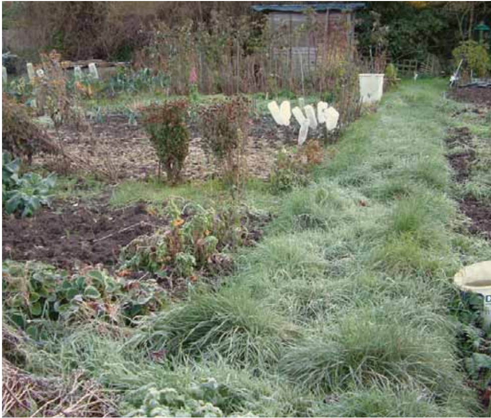
Broad grassy strips make excellent refuges and breeding sites for predatory beetles.

the devil's coach-horse) soldier beetles and carrion beetles. All these prey on common pests such as slugs, snails and caterpillars. Ground beetles are thought to be the 'number one' slug predator, better even than frogs!