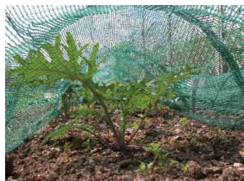
Netting will exclude a wide variety of pests. Garden Organic