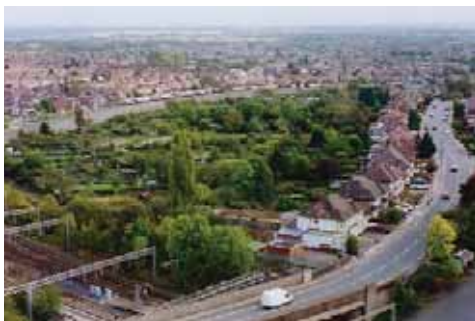
An urban oasis.

The situation was different in towns. Here, labourers welcomed the chance to be out in the fresh air, grow their