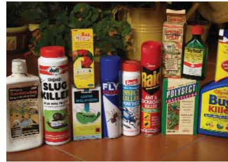
They all work, but they may kill friend as well as foe.

Attracting beneficial wildlife can be quite straightforward and this leaflet contains many tips for doing so. However, once you've encouraged some of nature's helpers to live on your plot you can't expect them to do all the work! A healthy population of predators on your allotment will help subdue a host of pests, but sometimes even they will be overwhelmed. In these cases you may have to step in to remove infested growth or even whole plants.