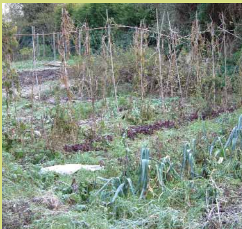
Old growth can make a valuable refuge for over-wintering wildlife.