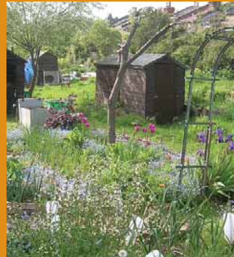
An urban allotment.

A number of organisations are working to reverse this trend including the National Society of Allotment and Leisure Gardeners ( www.nsalg.org.uk ) and the Allotments Regeneration