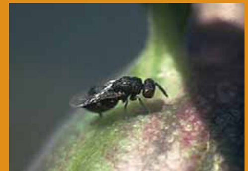
Less than 3 mm long, this gall wasp is parasitic on other insects.

Both solitary and social wasp species collect insect larvae, such as caterpillars, for food. Close relatives are the parasitic wasps. These are often