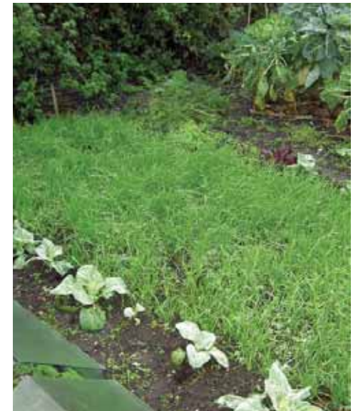
A fallow bed sown with Italian rye-grass Lolium multiflorum .

Comfrey is another plant that can be used to increase fertility. It has long roots that tap into stores of nutrients that have leached deep into the soil, the result being that comfrey leaves contain nearly as much nitrogen as farmyard manure and twice as much