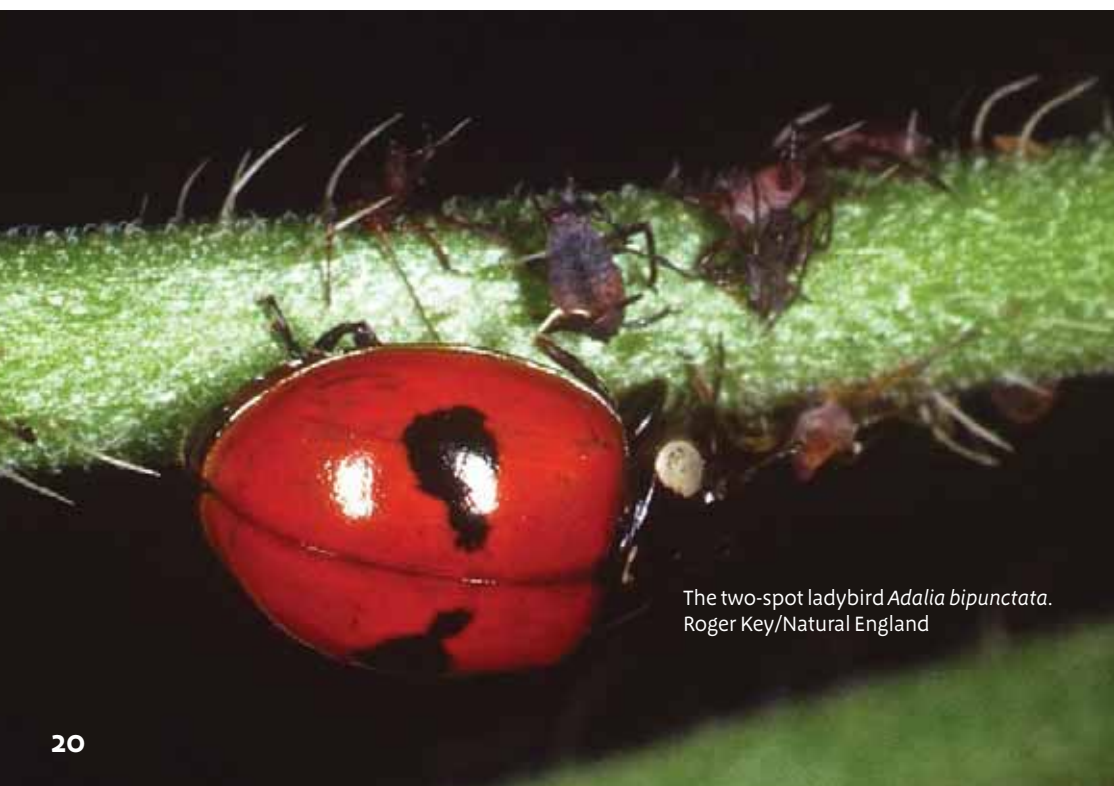
The two-spot ladybird Adalia bipunctata .