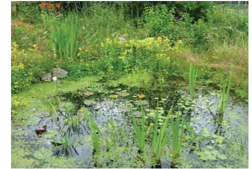
Do you have room for a pond?

In some cases the use of pesticides has even created pest problems! For example, the fruit tree red spider mite only became a significant pest in the 1930s following the widespread agricultural use of tar-oil sprays – the mites could cope with spraying far better than their predators and thrived as a result.