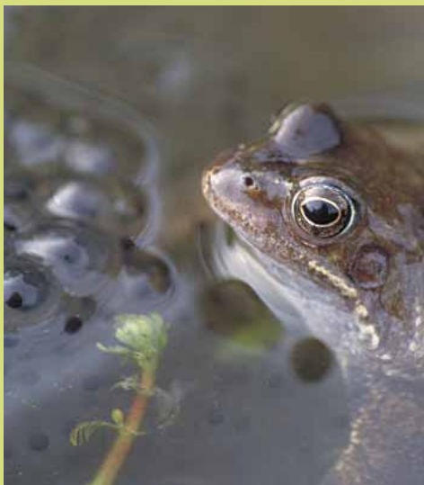
A prime slug predator, the common frog Rana temporaria.