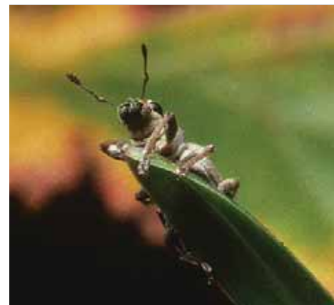
The pea and bean weevil Sitona lineatus .