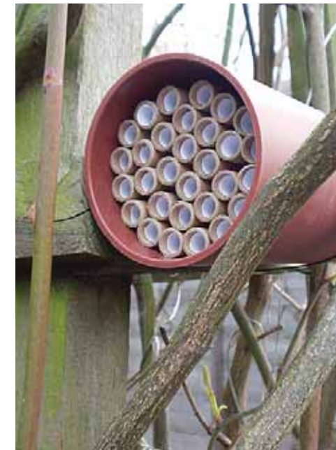
A ready-made 'bug hotel'.

There are many different groups of beetles and although some (flea beetles, for example) can be a nuisance, many are valuable allies. Useful species include ladybirds, ground beetles, rove beetles (such as