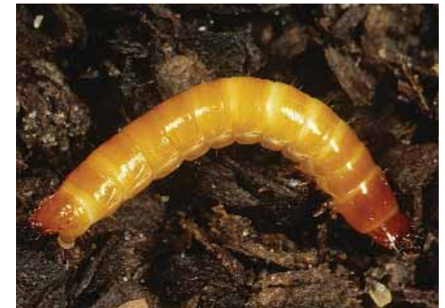
A wire worm Athous haemorrhoidalis .

These are rarely a problem, but they may gnaw the stems of young or weak seedlings at ground level. Avoid mulching very young plants as this gives woodlice cover. Woodlice have very weak jaws and are unable to attack older transplants.