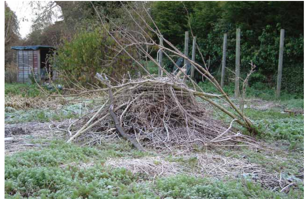
A bonfire pile can be a valuable winter refuge.

If your allotment suffers the unwelcome attention of human pests why not bolster your security with a prickly wild hedge? Holly, blackthorn, buckthorn, gorse, hawthorn, pyracantha and berberis can all be planted to create a prickly barrier; while bramble, dog rose and sweet briar can be grown through existing man-made fences to make climbing them a thorny problem!