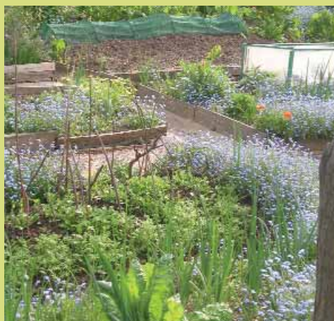
A display of flowers will draw many beneficial creatures to your plot.

If your plot has a hedge or fence as a boundary there might be an opportunity to increase its attractiveness to wildlife. Planting native hedging plants and trees such as hazel, elder, blackthorn, hawthorn, dog rose, field maple, beech, yew and the like will create nesting places for birds, shelter beneficial insects and provide