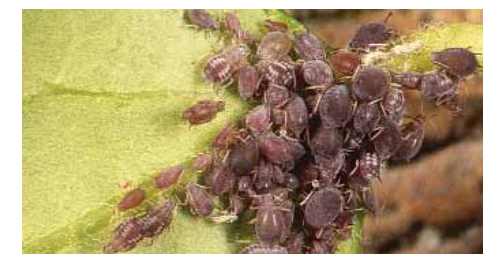
The dreaded greenfly (top) and the equally dreaded blackfly.