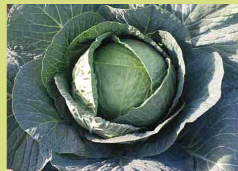
Cabbages and beans seem to make good planting partners.

A field trial by Garden Organic (formerly the Henry Doubleday Research Association) found that, where onions and carrots are grown together (and onions outnumber carrots four to one), attacks of carrot fly are far less severe. It is believed that the smell of the onions masks that of the carrots, literally throwing the carrot flies 'off the scent'. Onions and carrots make good companions for another reason – carrots are long-rooted and