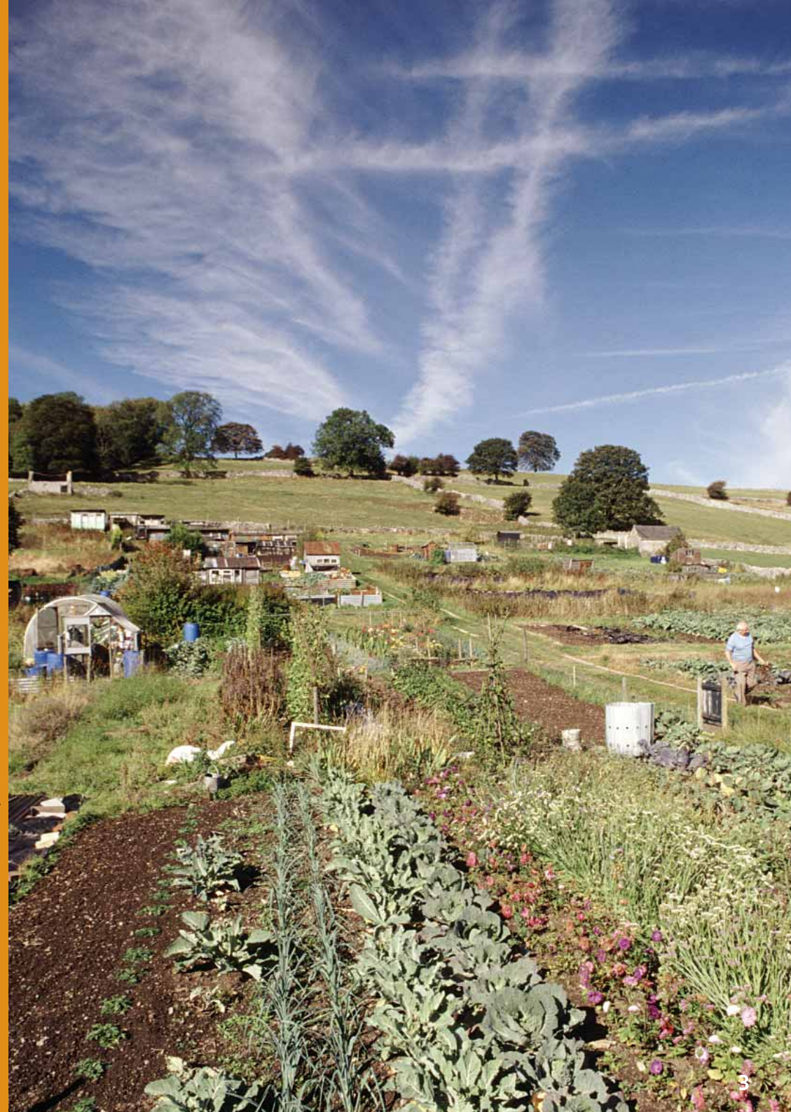
Fresh food and fresh air.