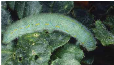
Caterpillar of the small white cabbage butterfly.

Two species of butterfly, large whites and small whites, are often lumped together as 'cabbage whites' (the