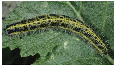
A large white cabbage butterfly caterpillar Pieris brassicae .