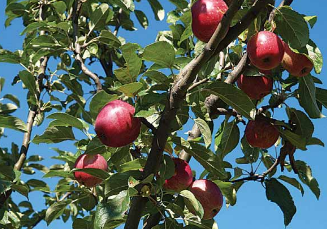
Orchards can be superb wildlife habitats.

they are not controlled. You should take particular care to control pernicious weeds such as couch grass to make sure they don't cause a problem for other plot-holders.