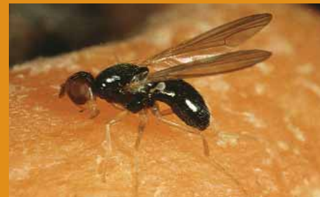
Small but pesky; the carrot fly Psila rosae .

This fly lays its eggs in the soil or occasionally on the plant itself. Cover the ground with fleece or a fine mesh straight after sowing or planting, or protect individual plants with special root fly mats. You can buy these or make your own from 12 cm squares of any soft woven material. A traditional remedy is to plant young brassicas in holes lined with rhubarb leaves. Apparently the smell puts them off.