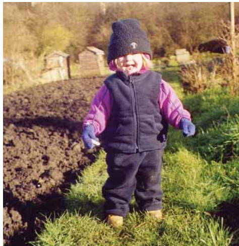
The next generation will need allotments too. Federation of City Gardens

Despite their popularity, allotment numbers have been in decline since WWII. In 1950 there were over one million in the UK, but today that number has dropped to around 250,000.