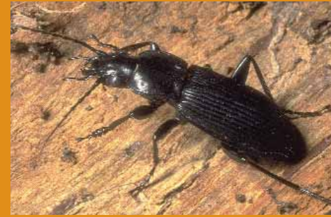
Ground beetles like Pterostichus niger will appreciate undisturbed ground.

Large-scale beetle banks are often seen on organic farms where field margins and mid-field strips are deliberately left unploughed. Some allotment holders subdivide their plots into separate beds using grass strips, and beetles will benefit if you broaden