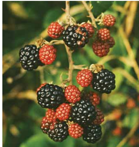
Brambles will provide food and shelter for a wide variety of beneficial wildlife.

Untended plots may be taken over by bramble which is an excellent food source and refuge for many kinds of wildlife. Apart from attracting insects such as hoverflies, bees and lacewings, a tangle of brambles is a favourite nesting site for birds like robins, wrens, song thrushes and blackbirds. Some warblers and finch species may also use bramble in this way. To control bramble, cut different sections back on a three- or four-year rotation so there is always a gradation between first-year growth and mature stems; this means you can keep a plot relatively tidy but still retain much of the wildlife benefit.