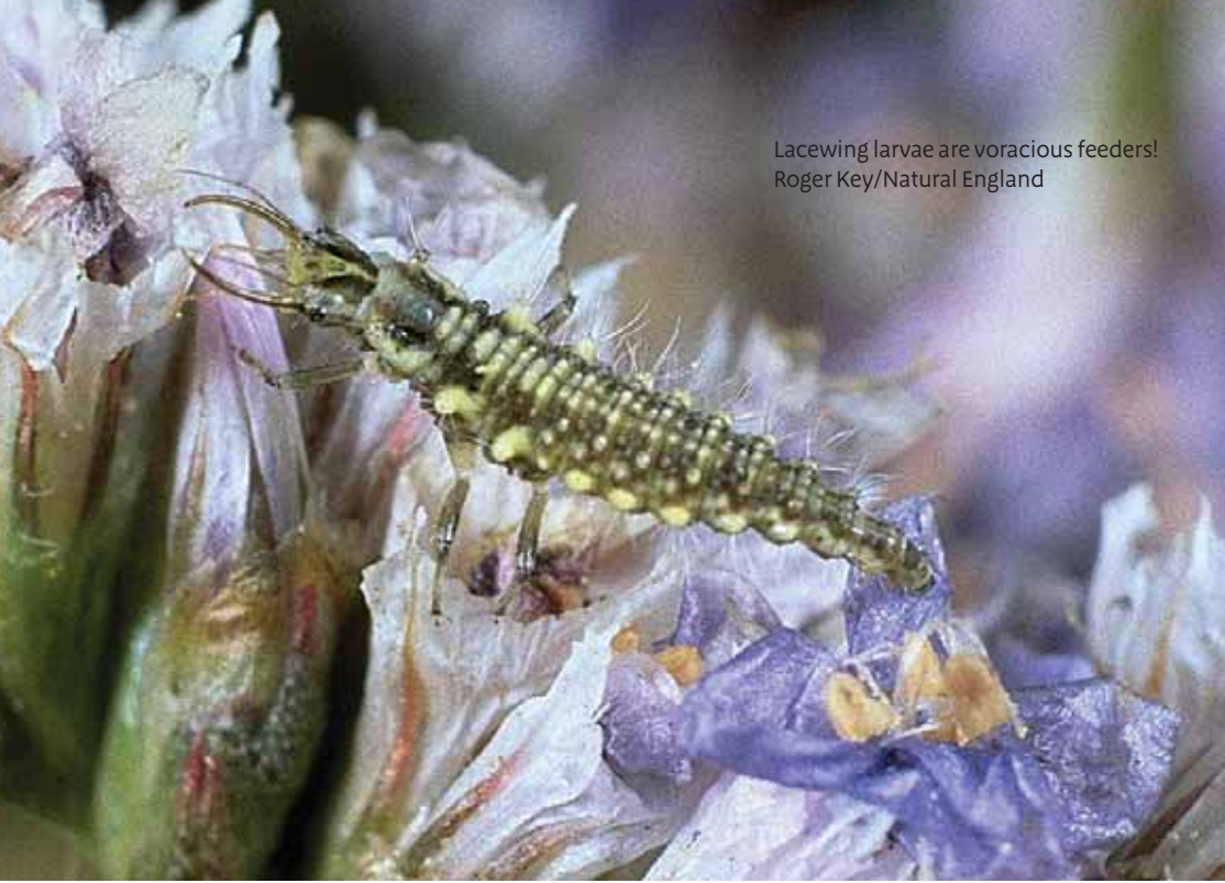
Lacewing larvae are voracious feeders!