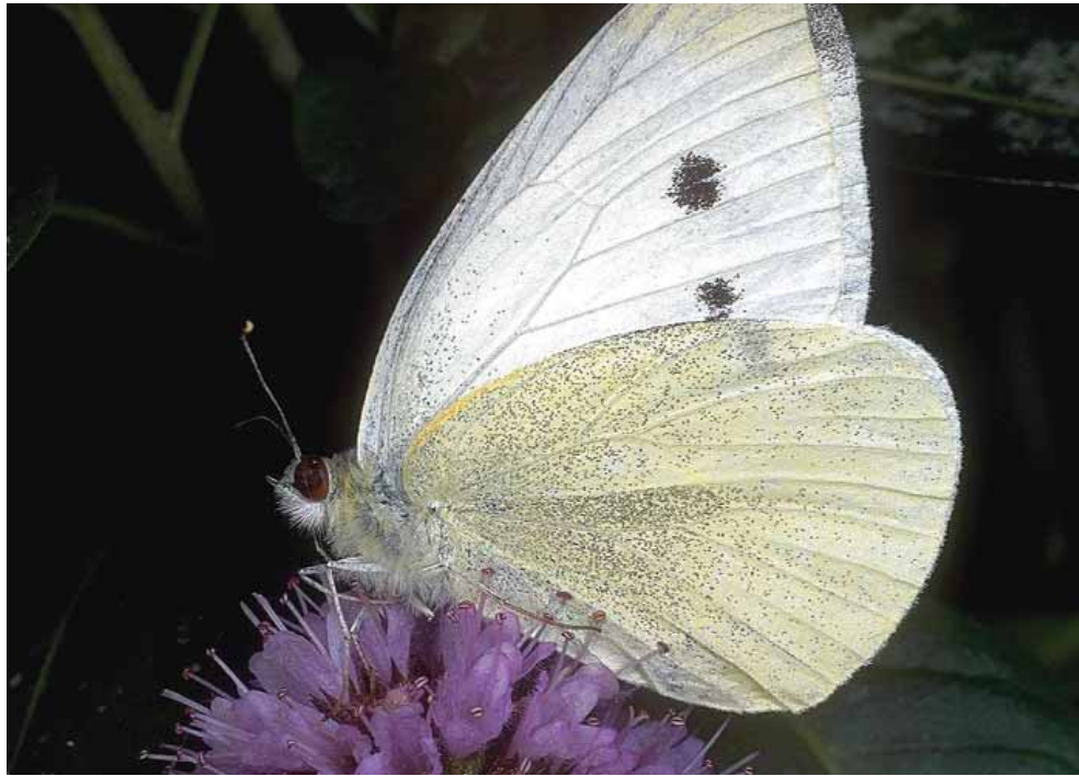
The small white cabbage butterfly Pieris rapae .

sooty mould fungi and they also transmit diseases such as cucumber mosaic virus. Overfeeding plants with nitrogen often encourages aphids as this results in the soft sappy growth they love.