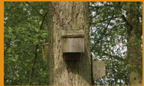
Bats need boxes too!

The best ways to encourage beneficial birds onto your plot are to put up bird