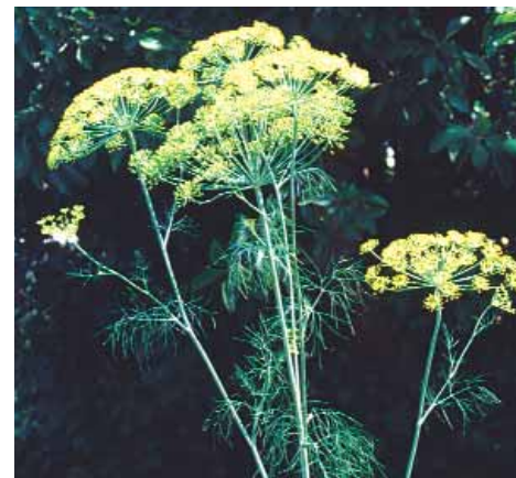
Plants such as dill Anethum graveolens have open umbelliferous flowers that are popular with many insects.

berries for food. Plot holders can also benefit from this natural harvest; the berries and flowers of elder, rosehips, and blackthorn sloes all having a use in