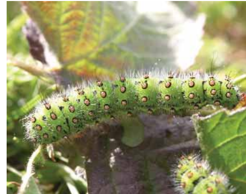
An emperor moth caterpillar Pavonia pavonia on bramble.