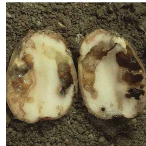
Potatoes damaged by slugs.

These also attack tayberry, blackberry and loganberry. Remove mulches in the