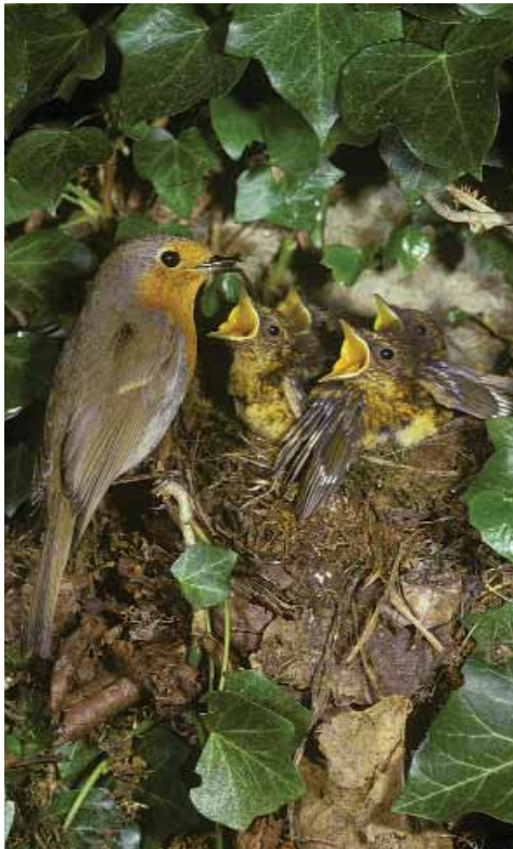
Time hedge pruning to avoid the nesting season.

hedge in rotation each year. This leaves one third undisturbed for at least two years. Remember to consult your allotment authority if you plan to replant an old hedge or start a new one.