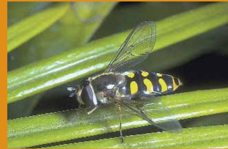
A hoverfly Metasyrphus luniger .

A single ladybird can eat 100 aphids a day and they will also consume whitefly, potato beetle, bean beetle and mealy bugs, amongst others.