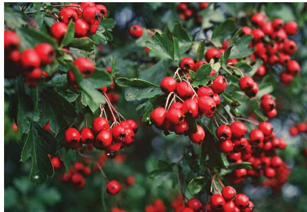
Hawthorn is one of the most valuable hedging plants.

If there is a hedge on your allotment, prune it in late winter after the berries have gone, but before the start of the nesting season as it is illegal to disturb nesting birds. The end of January is a good time. To lessen the impact of pruning, cut back only a third of your